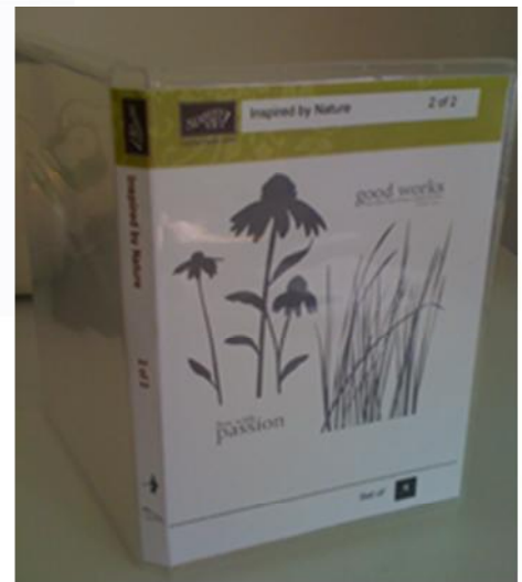
Figure 3 – Insert in DVD Case