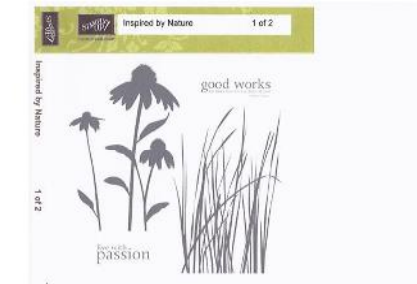
Figure 2 – Printed Insert Page after Cutting 5.5 x 7